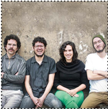
AI Borda ARQUITECTS Colaborative Architecture Studio - Ecuador